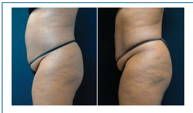
Figure 2. Digital photographs taken at (left to right) baseline and at 1-month posttreatment. At 6 months, the 50-year-old woman showed 24.8% fat reduction, 23.7% muscle thickening, and 8-cm waist circumference reduction.

Simultaneous application of HIFEM and RF is safe and effective for muscle toning and fat reduction. The results suggest this application as more effective for fat reduction and muscle increase than using these energies stand-alone or